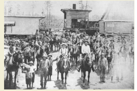
Lumberjacks at Logtown, circa 1890.

After the Weston mill closed in 1930, Logtown's population decreased steadily. A rich community life continued, however, in Logtown and in the Point, the mostly African-American community north across the Bogue Homa from Logtown. According to local lore and some former residents, the making of homemade whiskey, or moonshine, became common until the end of Prohibition in Hancock County after the closing of area timber mills.